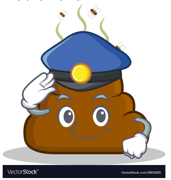
image description - vectorstock - id#16911655 used so far without permission - will be seeking permissions in public presentation of this message.

An emoji pile of poo with a somewhat smiling face- of an apparent officer of the law by wearing such identifying head dressed hat.